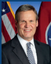
Governor Bill Lee