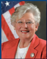
Governor Kay Ivey