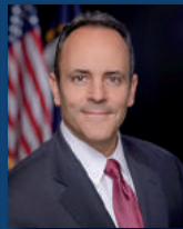
Governor Matt Bevin