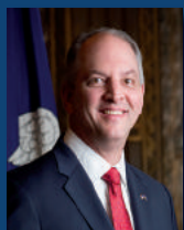
Governor John Bel Edwards