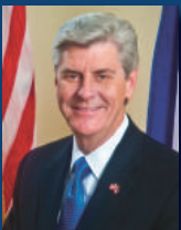
Governor Phil Bryant