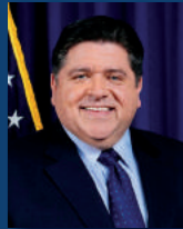
Governor J.B. Pritzker