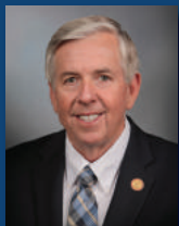
Governor Mike Parson