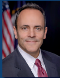
Matt Bevin States' Co-Chair